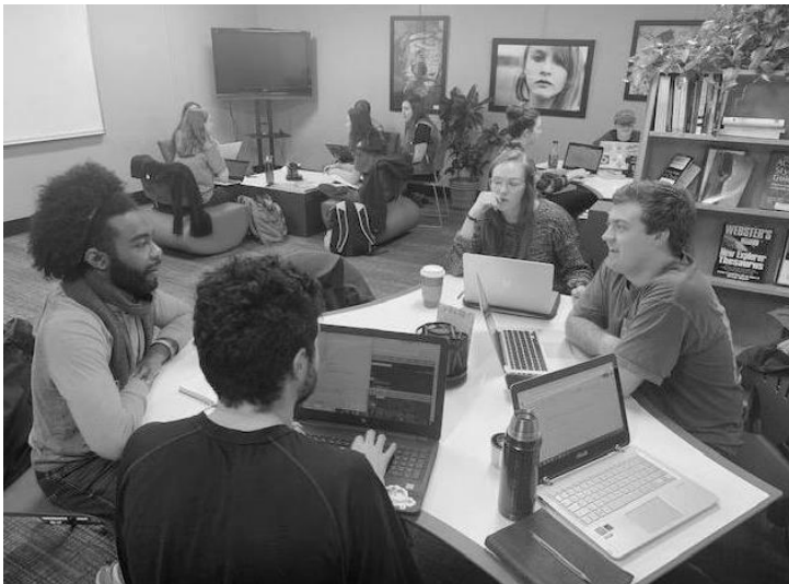
Figure 5. Four students writing on laptops and talking.

In the coming year, the new team of staffers seeks to improve services by clarifying the goals and practices of TUWC to campus community members, by developing stronger ties to campus writing stakeholders, and by being more proactive in communicating our vision via our new website ( embed link ) and active social media presence ( embed link ). With these goals in mind, the TUWC strives to cultivate the human relationships at the core of a liberal arts education. As one staffer articulated, “the writing center provides this really useful academic resource, but, in a way, it is kind of like a support system too. People are always here just to see how you are doing and are always willing to collaborate with you in whatever way that might be.”