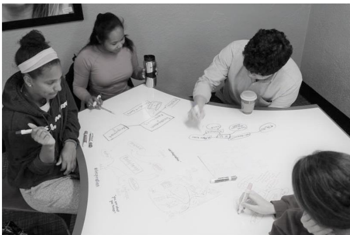
Figure 1. Four students working collaboratively.