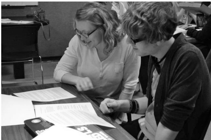
Figure 3. Consultant and student reading together.

The Transylvania University Writing Center curates a space that serves as a resource to faculty and students alike, focusing on the evolving needs of the campus community. Data collected during this past academic year show that over 66 percent of all available consultation hours were scheduled for individual appointments. This is a dramatic increase from the previous two years where only 33 percent of available hours were used: TUWC doubled its amount of one-to-one peer consultations in such a brief timespan. The vision of the TUWC is to have consistent and sustainable growth, both as a staff and within the institution. Our new location receives more student traffic and has allowed for greater visibility for the Center as a whole. With a more central location, the TUWC has seen an increase in individual appointments. Similarly, the space has shifted from being strictly reserved for Writing Center activities to a more inclusive setting for the academic and social arenas of Transylvania's campus. Now more than ever, events such as poetry readings and student newspaper workshops are hosted in the Writing Center, organizations use the space for regular meetings, and students choose to gather for group study sessions.