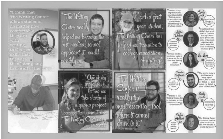
Figure 4. TUWC brochure (Courtest of Jordan Long).

involved in course-embedded tutoring stated that they were likely to come back outside of their class.