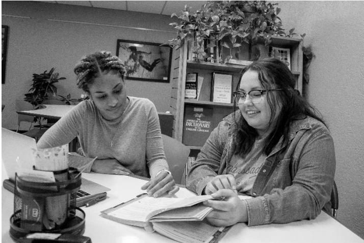
Figure 2. Consultant working with student.

staffers are pursuing opportunities in fields such as law, medicine, education, digital media, public policy, conflict management, and programming.