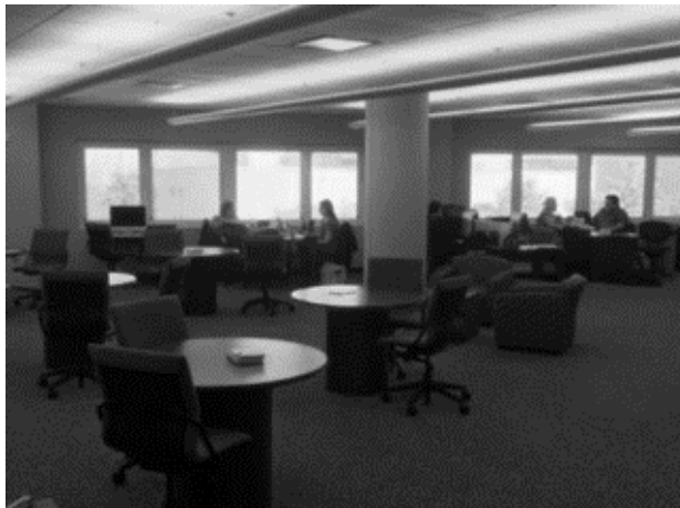
4. Our space has lots of room, ample natural light, and a wonderful view of campus from the third floor of the James Walker Library.