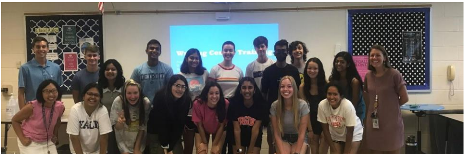
Figure 4. 2022-2023 Writing Center teacher sponsors and staff smiling after completing their summer training session.